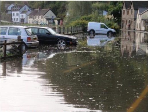
Tidal Flooding at Tintern, 2012.